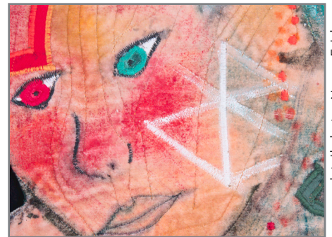
detail