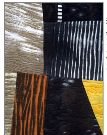
detail