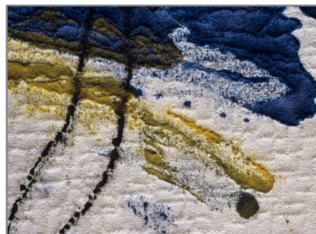
detail