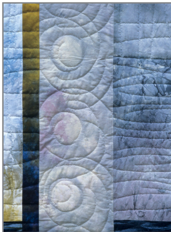
detail